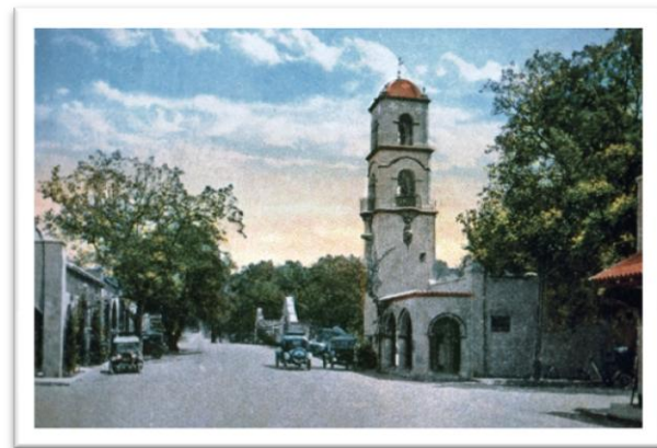
Postcard of Ojai Post Office Tower, Arcade and Pergola