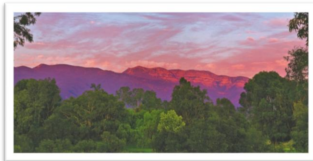
Pink Moment over the Topa Topa Mountains

After the facelift was completed in 1917, the town changed its name from Nordhoff to Ojai. Ojai today is known for its artists, educational institutions, rich musical presentations, delicious tangerines, tennis tournaments, spiritual and health offerings, and scenic beauty.