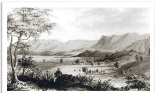
1854 Lithograph of the lower valley by A.H. Campbell