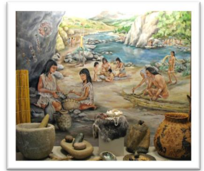
Chumash painting by Oatley Kidder-OVM

The Chumash arts of basket weaving and boat construction are well known, and their extensive cosmology has been documented. The Chumash called the Ojai Valley "Awhai" (A-HA-EE), meaning moon. The Awhai village, one of five main villages in this area, was located in the Upper Ojai Valley.